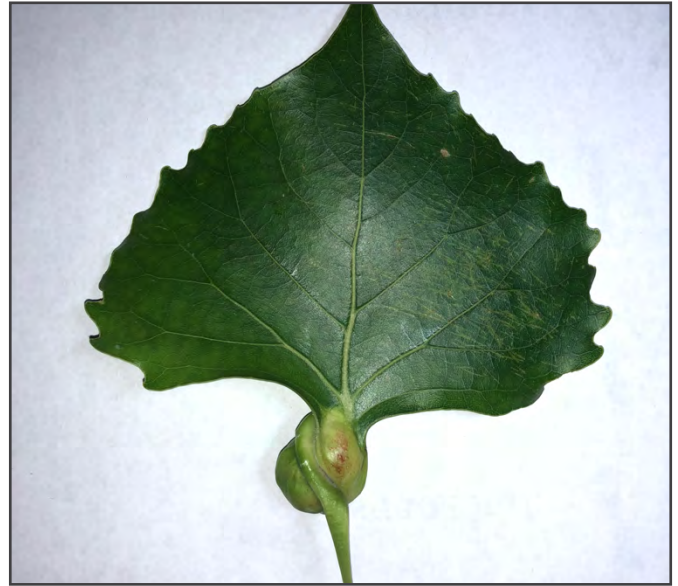
The Pemphigus Gall Aphid, Pemphigus populitransversus, is a pest of poplars. The first image is the gall on the base of the leaf and the image below is of the aphids inside the gall.

Insects and other arthropods, combined with disease and abiotic stressors such as drought, unusual temperatures, and wind contribute to stress in trees. These stresses will impact the health of trees and their vulnerability to herbicides.