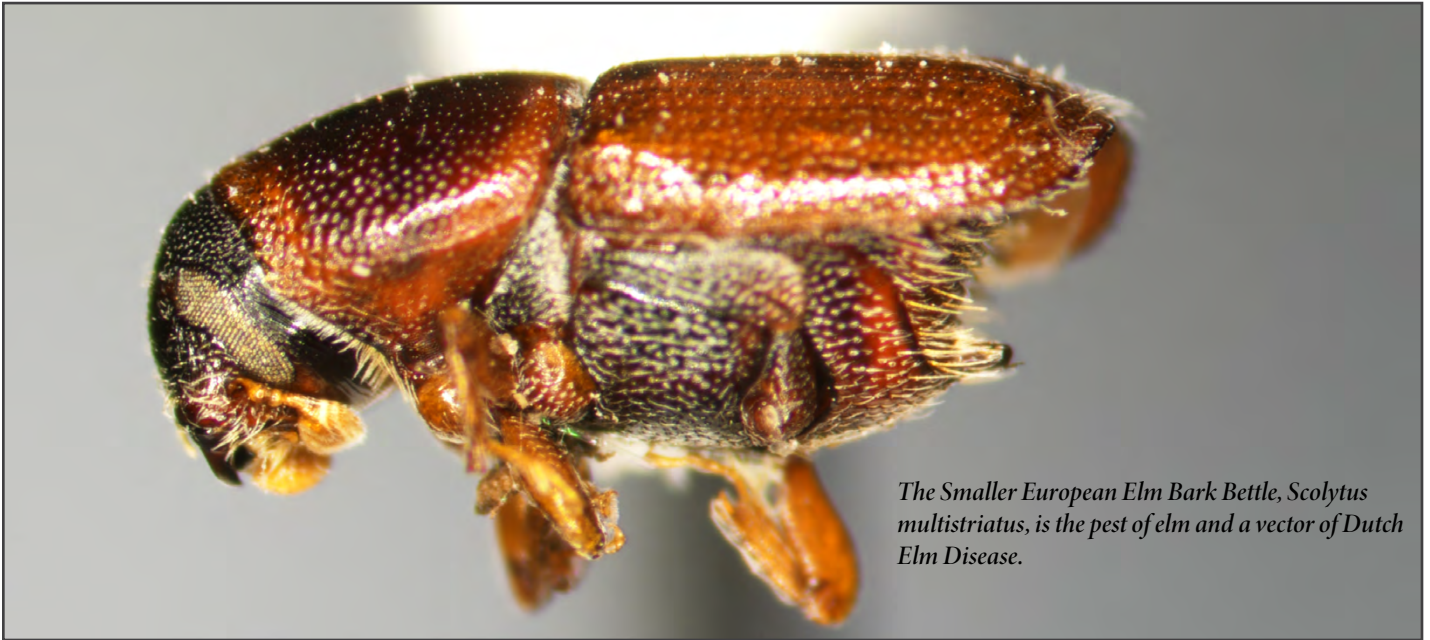
The Smaller European Elm Bark Beetle, Scolytus multistriatus, is the pest of elm and a vector of Dutch Elm Disease.