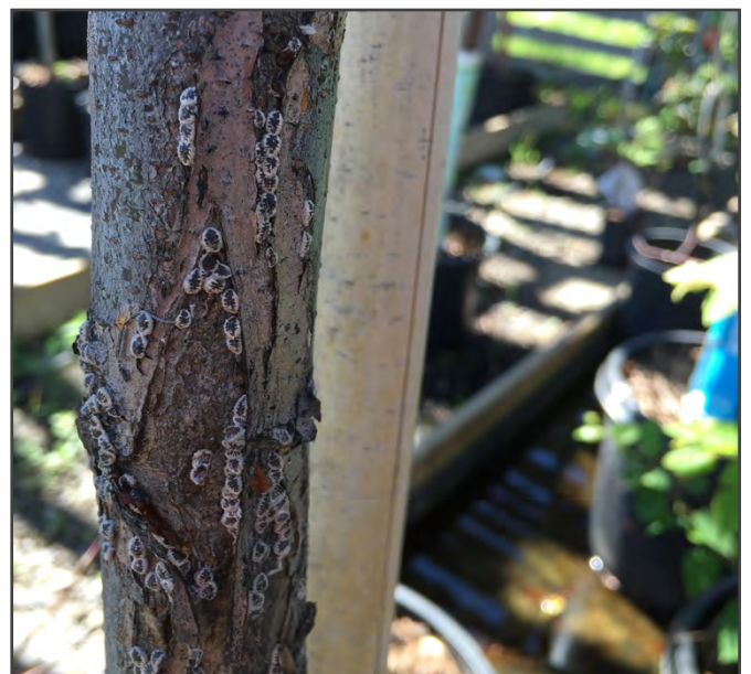
The European Elm Scale, Eriococcus spuriosus, is a serious pest of Elm in Alberta